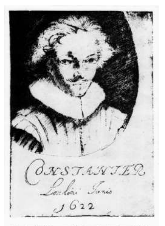
Constantijn Huygens Zelfportret, zilverstift op perkament, in 1622 te Londen gemaakt. Verblijfplaats niet bekend.