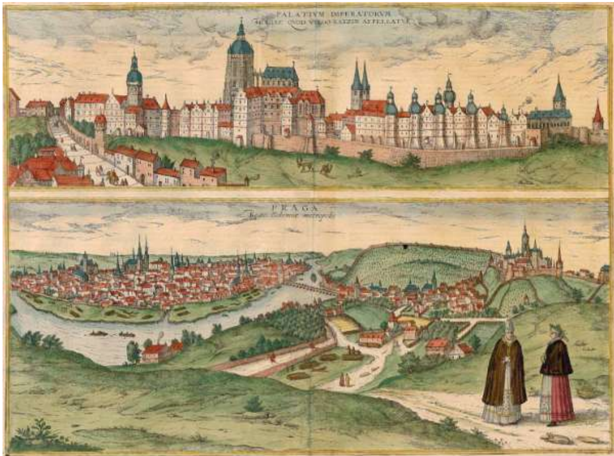
Palatium Imperatorum Pragae quod vulgo Ratzin Appellatur and Praga Regni Bohemiae Metropolis - Braun and Hogenberg, 1588-1617.