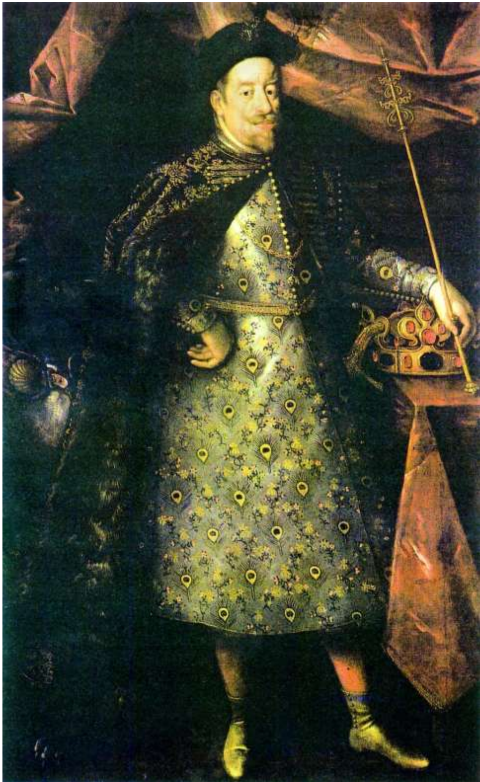
Matthias von Habsburg in coronation cloak, with the jewels of the Czech kings