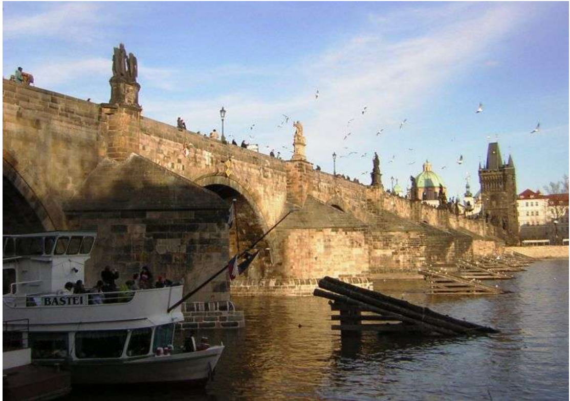
Praha, Charles bridge from Kampa