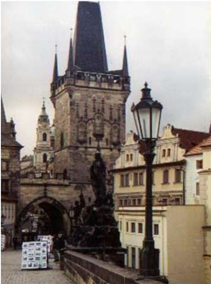
Praag, Mala Strana, St Nicholas Church from Charles Bridge