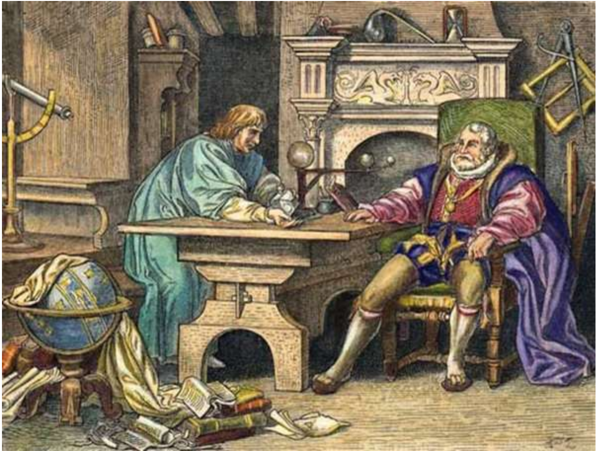
Johannes Kepler German Astronomer with Rudolf II