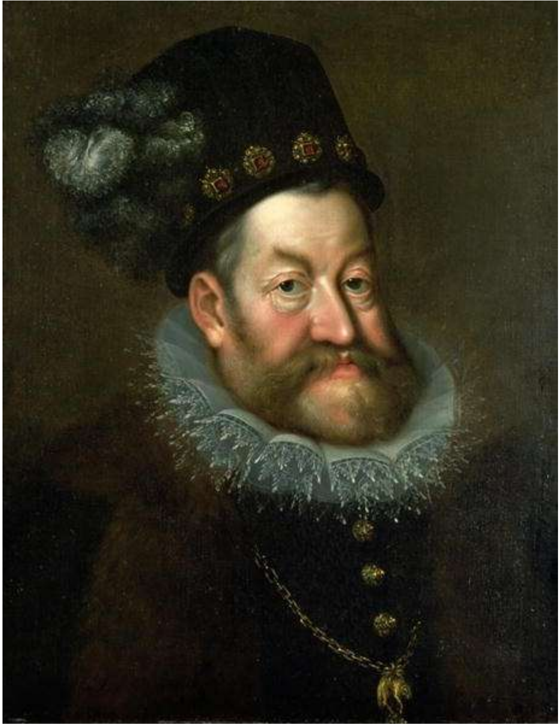
Hans von Aachen 1607 approx Rudolf II