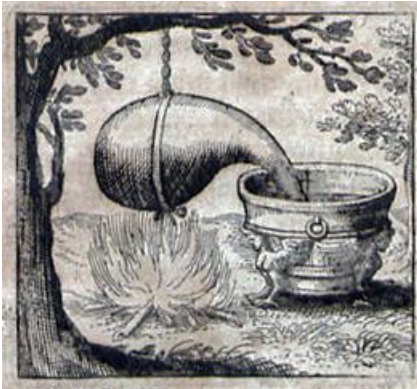
1628 German, Frankfurt

( https://books.google.nl/books?id=f2Y6AAAAcAAJ&hl=nl&source=gbs_navlinks_s )