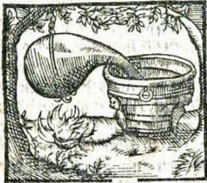
1624 German, Erfurt

( https://play.google.com/store/books/details?id=oYM5AAAAcAAJ&hl=en )