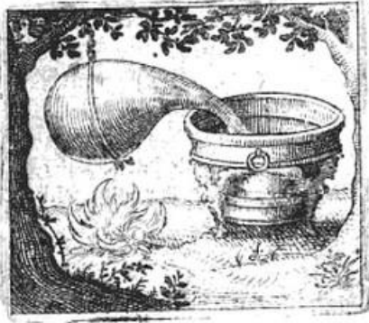
1608 German, Leyden

In Dutch and German versions of “Een kort tractaet van de natuere der elementen” we found a few other remarkable examples: